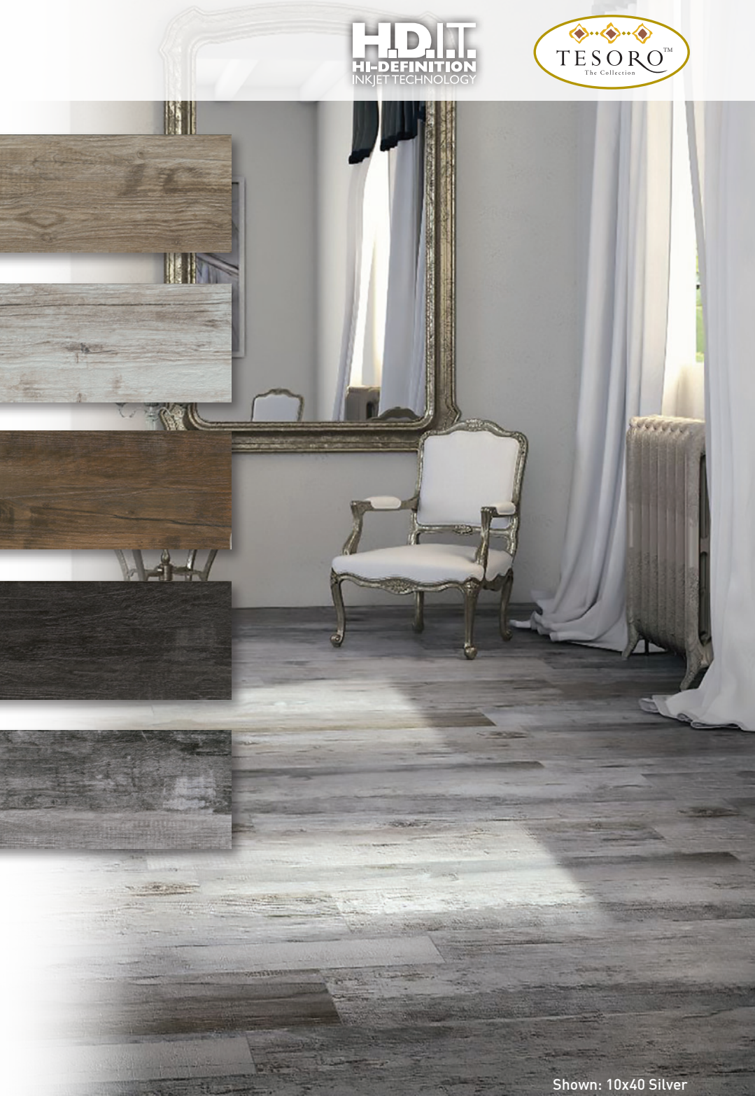
Shown: 10x40 Silver