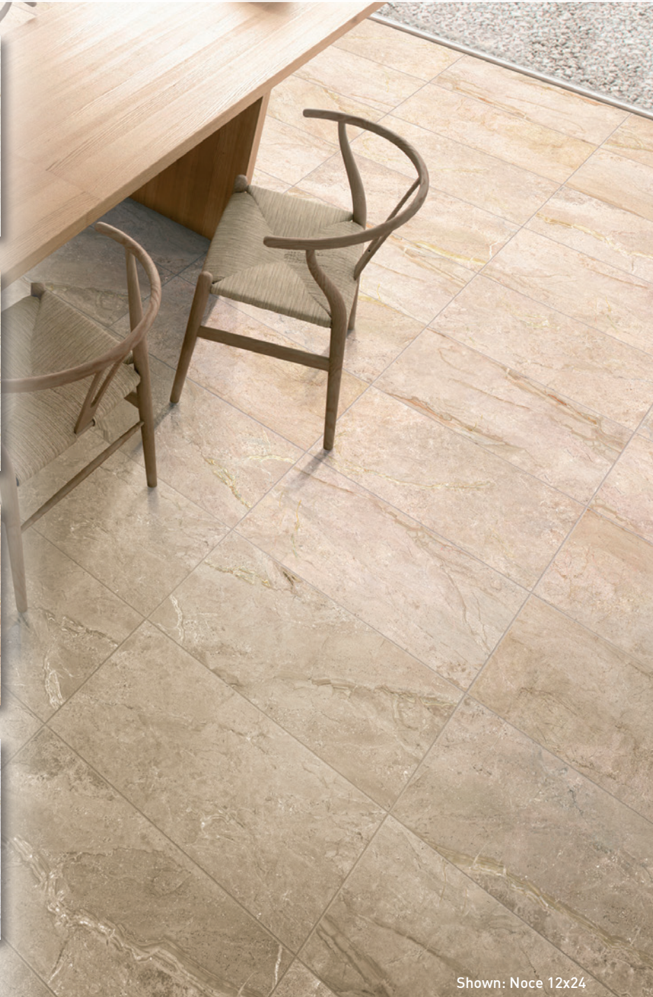
Shown: Noce 12x24