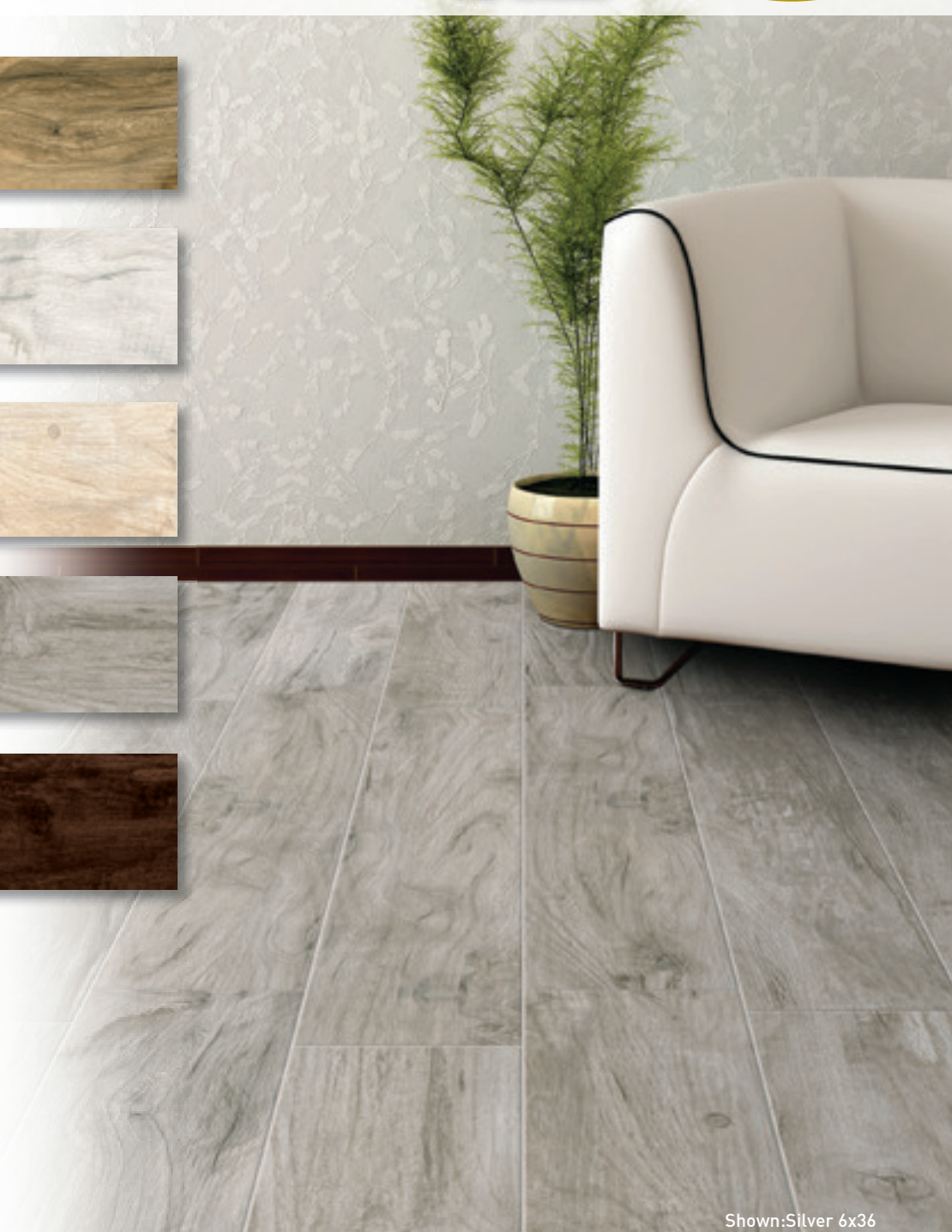
Shown: Silver 6x36