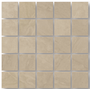
Mosaic (Marfil shown)