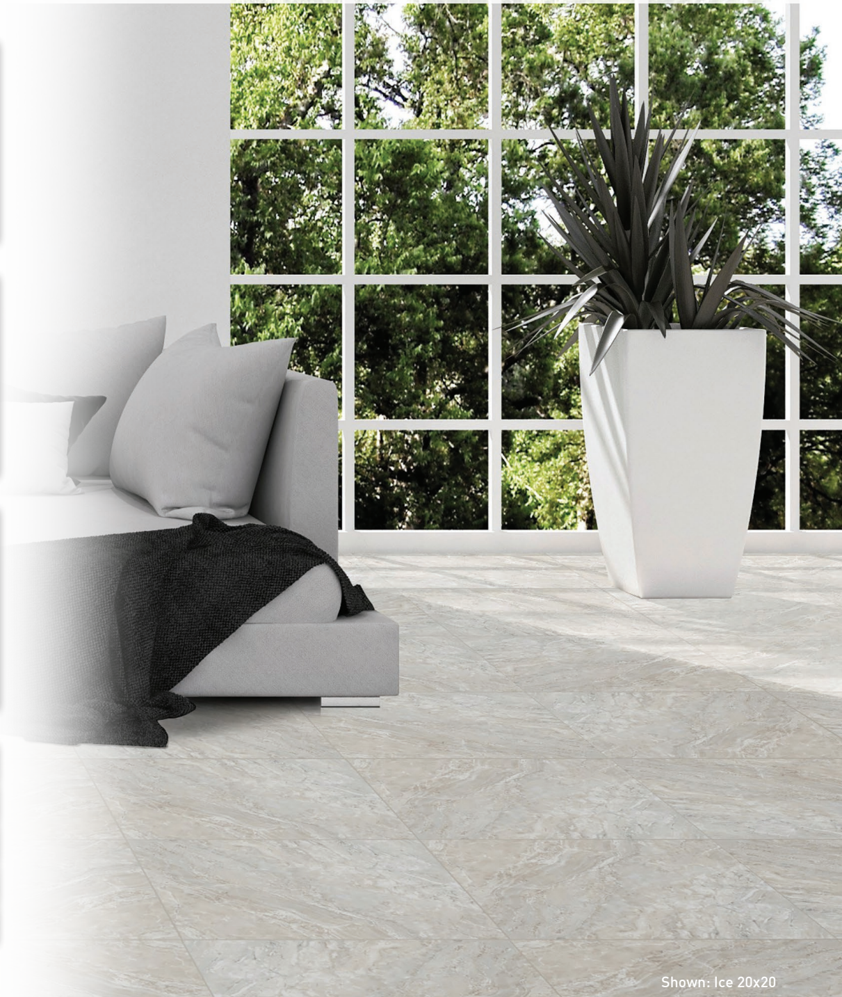
Shown: Ice 20x20