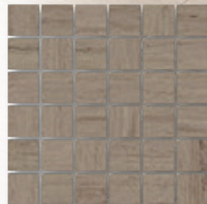
Mosaic (Moka shown)