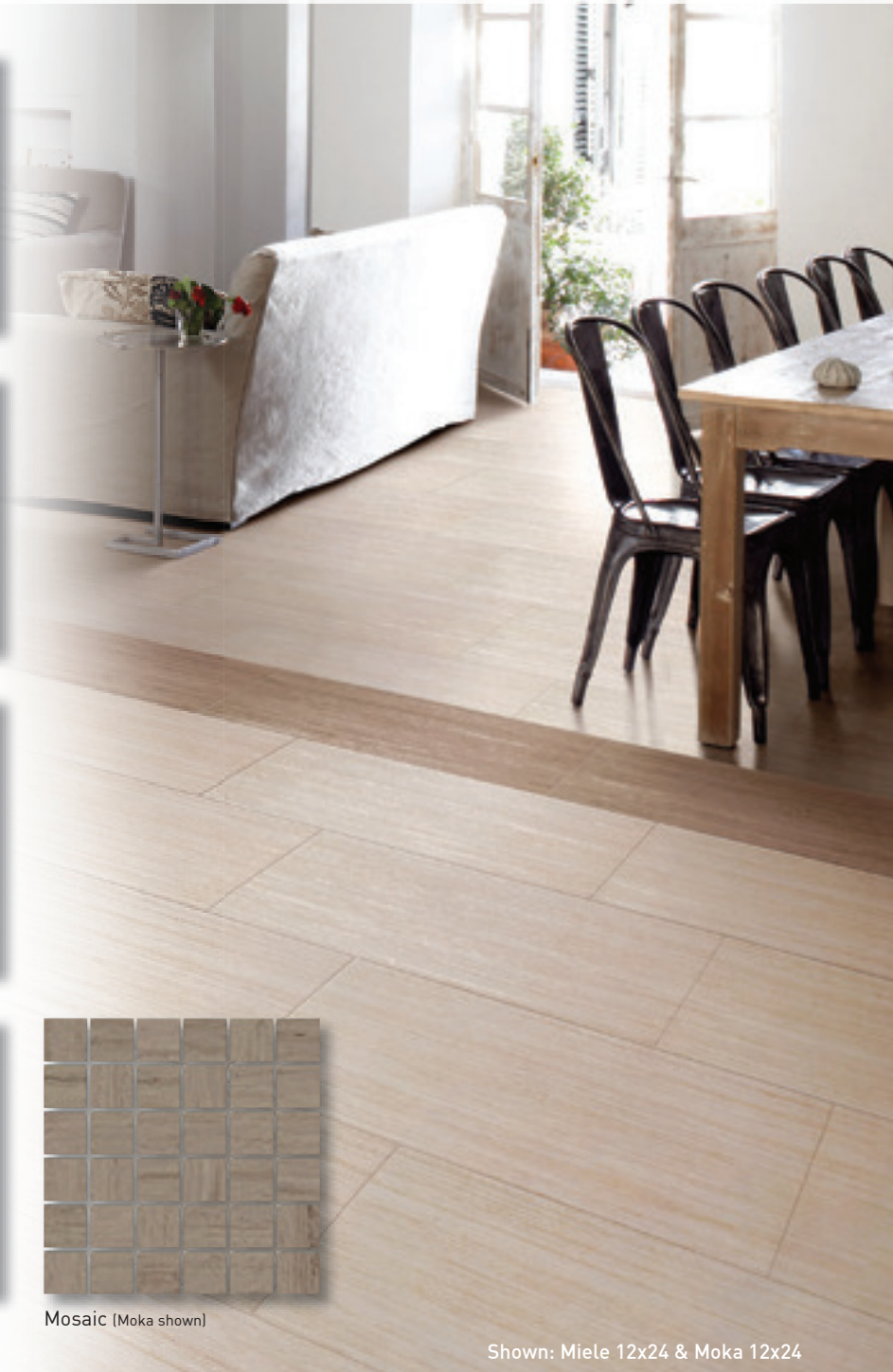
Shown: Miele 12x24 & Moka 12x24