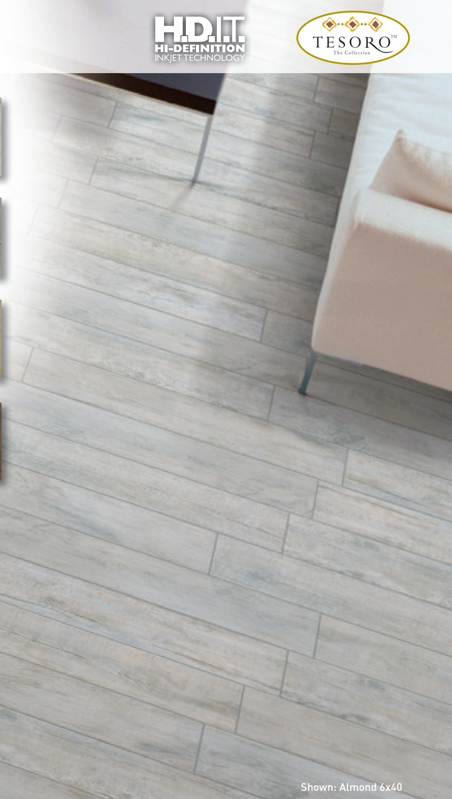
Shown: Almond 6x40