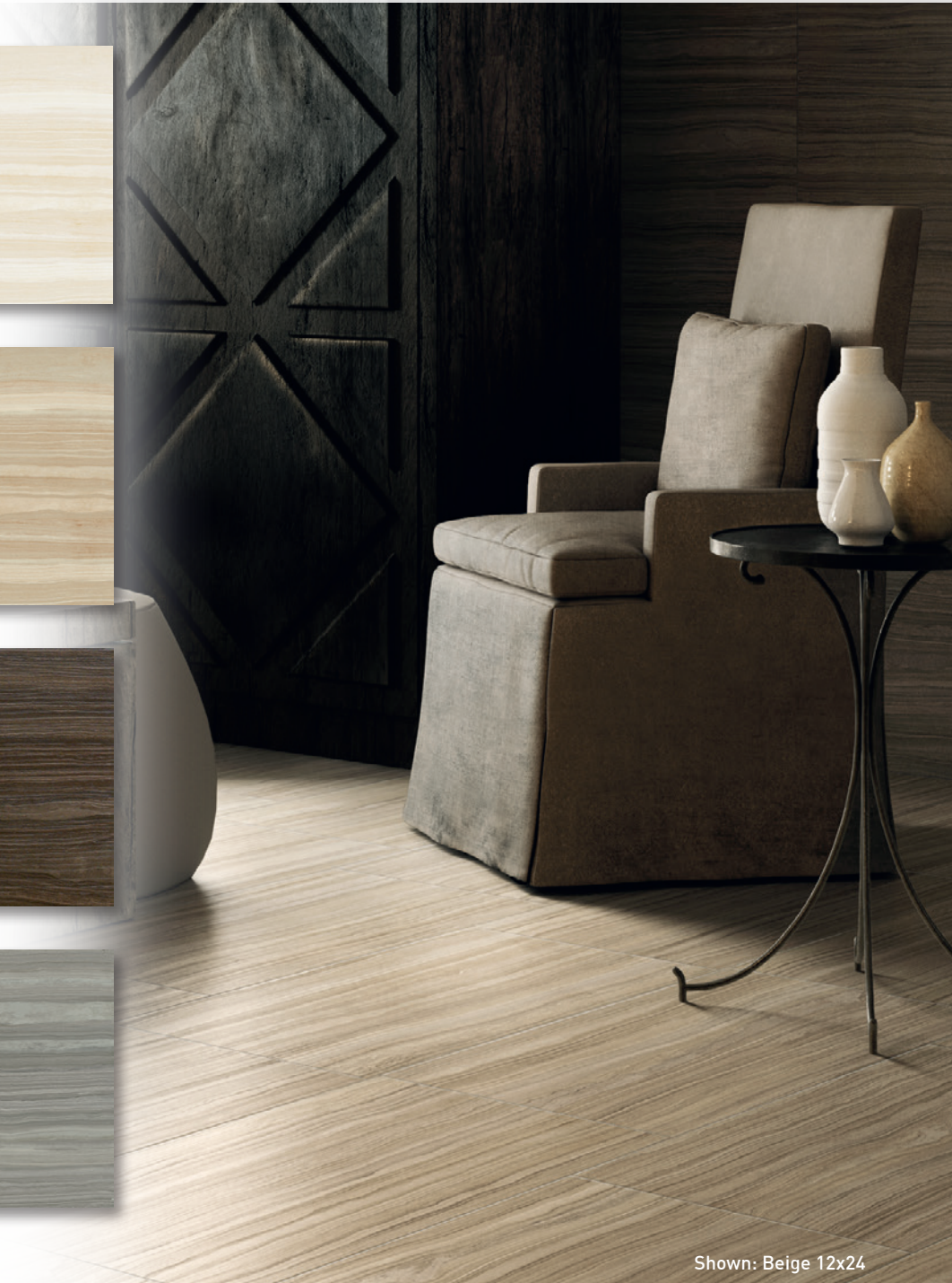
Shown: Beige 12x24