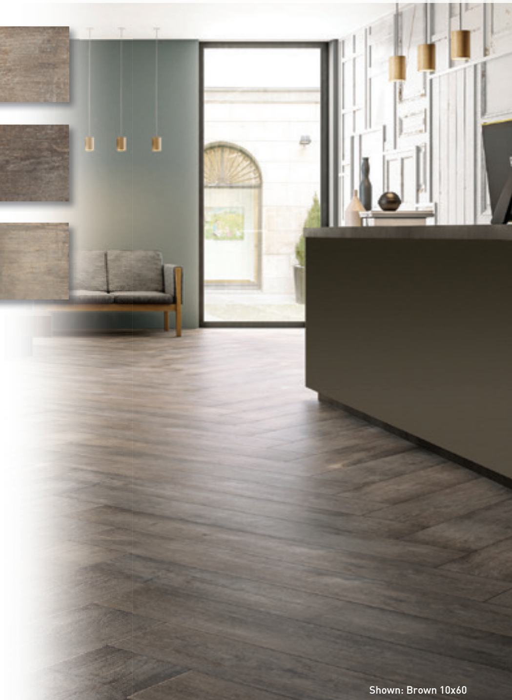
Shown: Brown 10x60