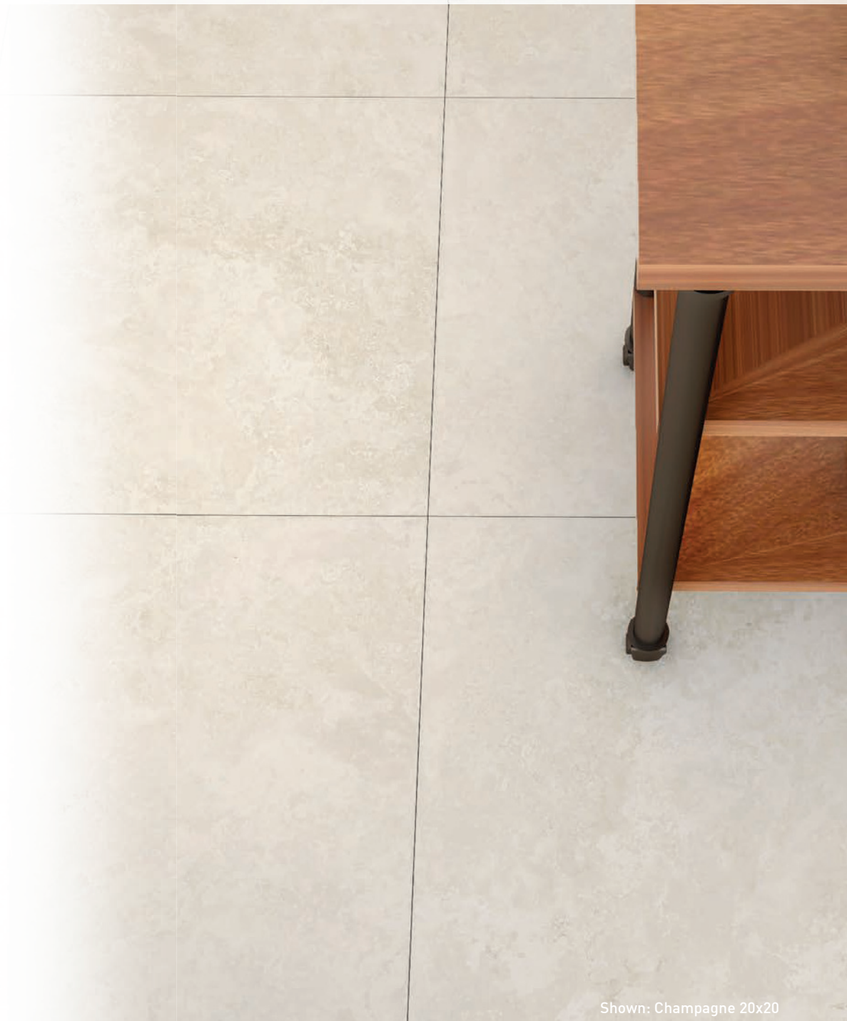
Shown: Champagne 20x20