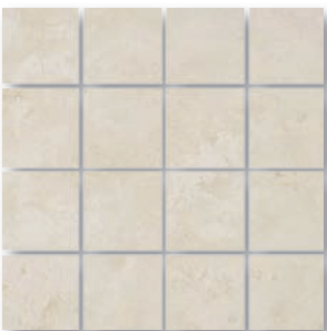
Mosaic (Champagne shown)