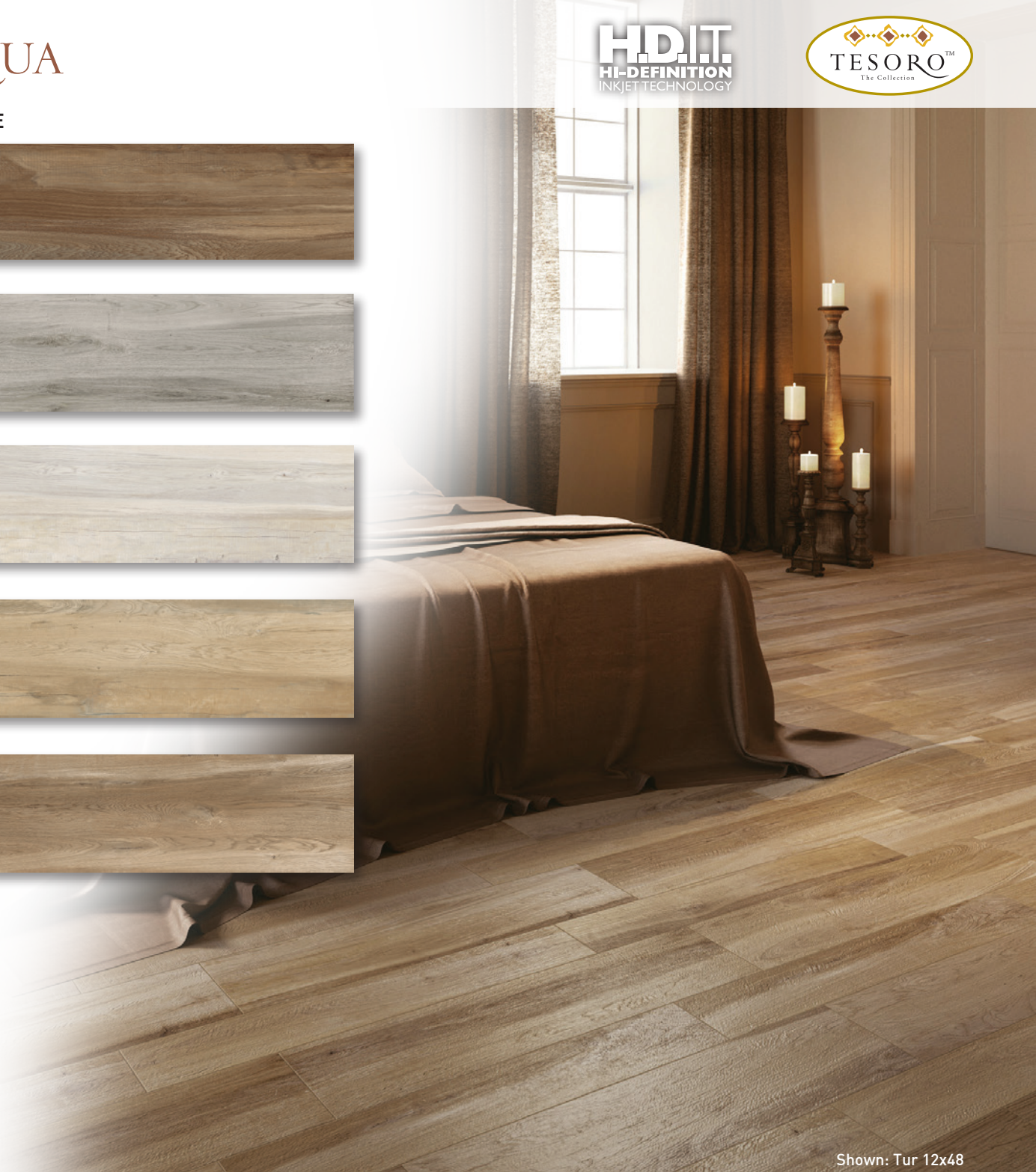
Shown: Tur 12x48