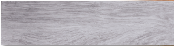
Ocean Breeze Gray