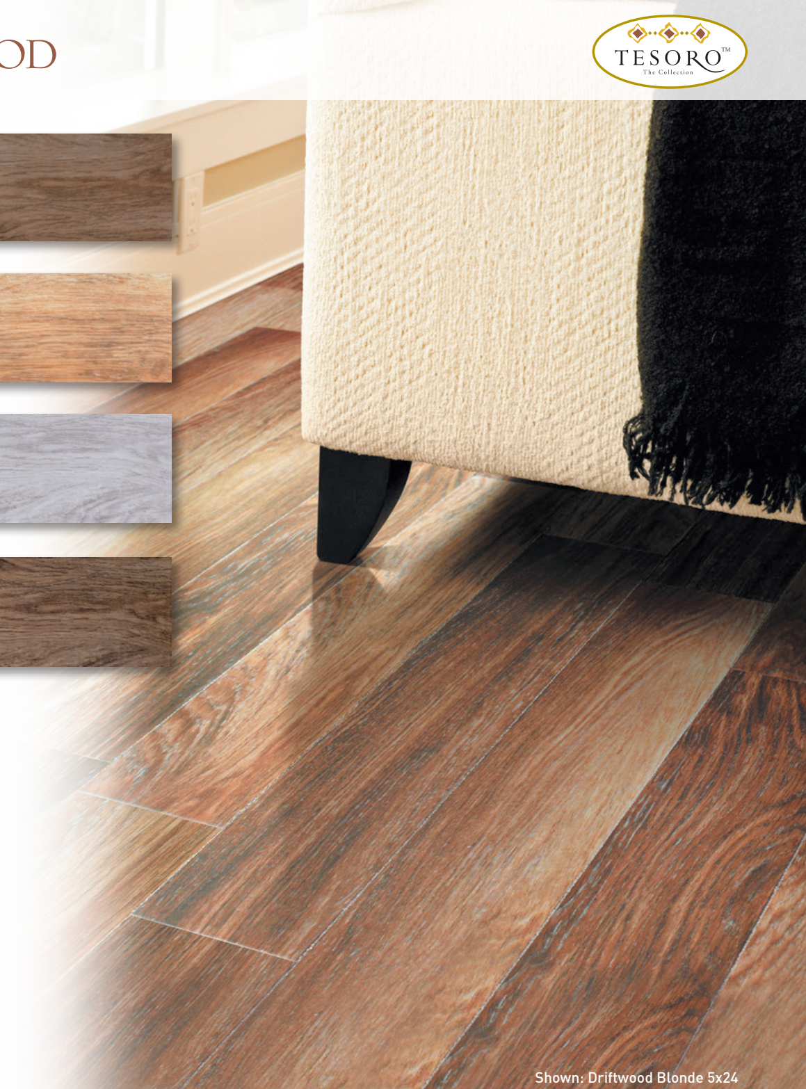
Shown: Driftwood Blonde 5x24