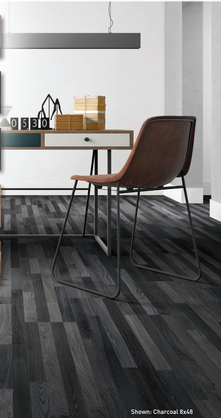
Shown: Charcoal 8x48