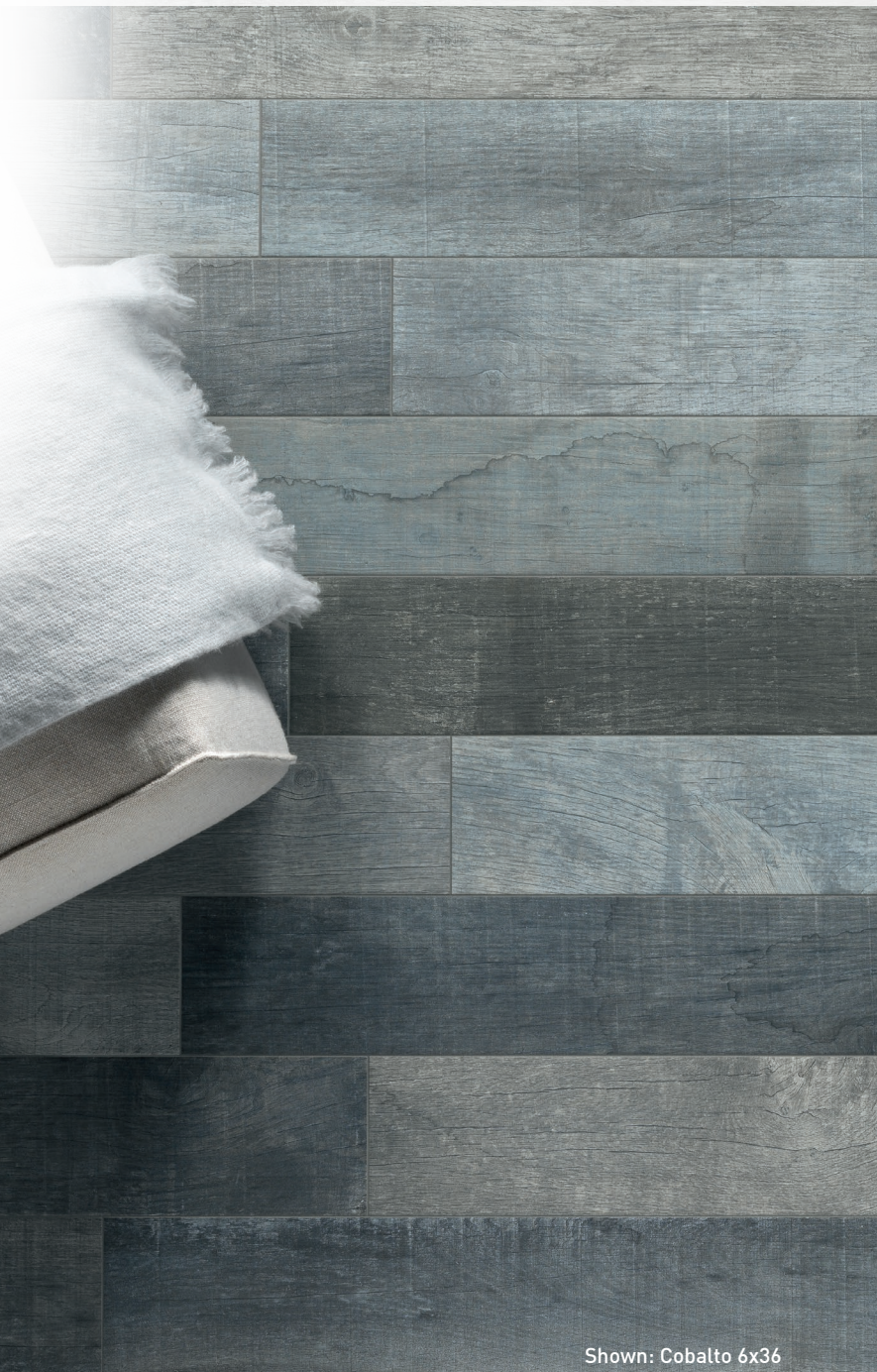
Shown: Cobalto 6x36