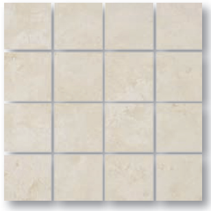
Mosaic (Champagne shown)