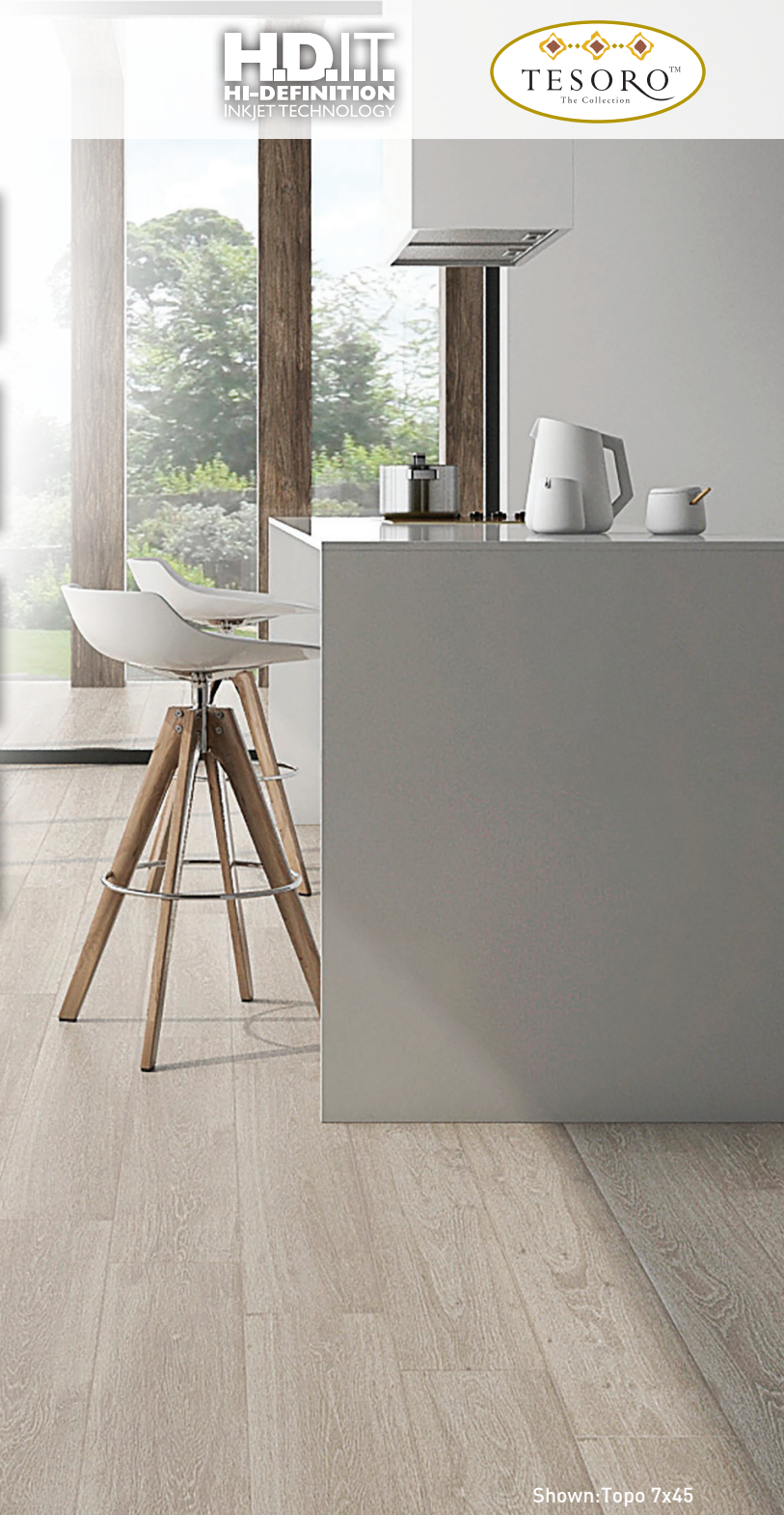
Shown: Topo 7x45